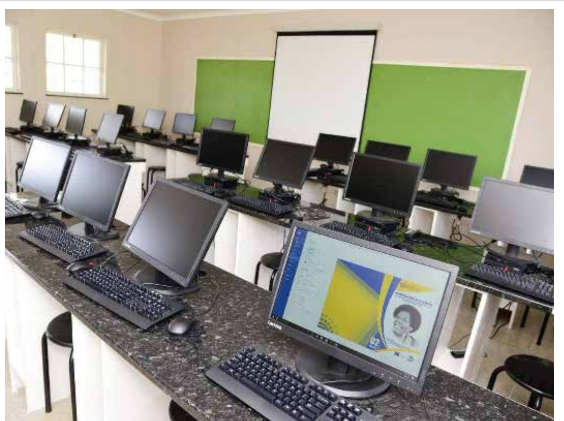
Computers donated by the Eastern Cape Department of Education and the Industrial Development Corporation to the Albertina Sisulu Primary School in Tsomo in the Eastern Cape.