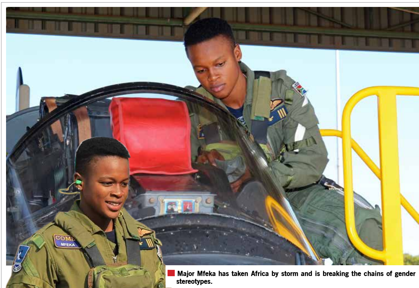
Major Mfeka has taken Africa by storm and is breaking the chains of gender stereotypes.