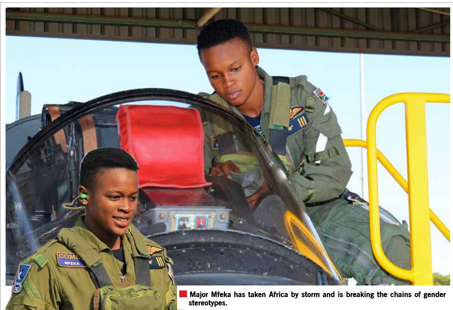
Major Mfeka has taken Africa by storm and is breaking the chains of gender stereotypes.