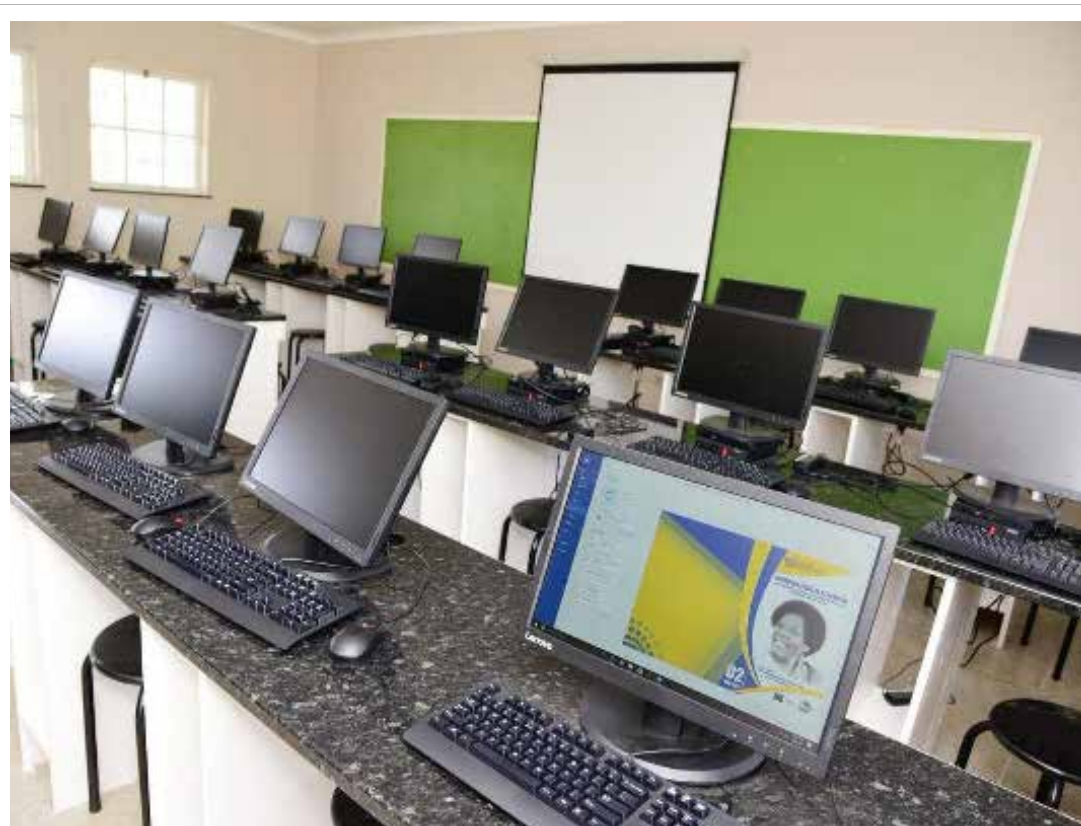
Computers donated by the Eastern Cape Department of Education and the Industrial Development Corporation to the Albertina Sisulu Primary School in Tsomo in the Eastern Cape.