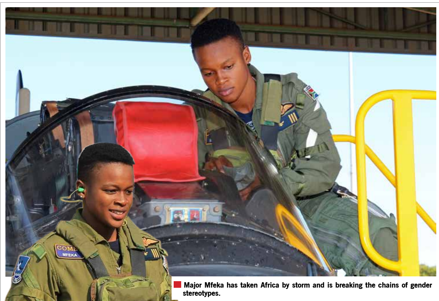
Major Mfeka has taken Africa by storm and is breaking the chains of gender stereotypes.