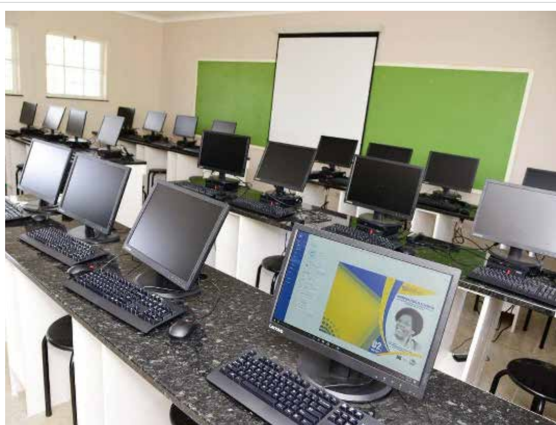
■ Computers donated by the Eastern Cape Department of Education and the Industrial Development Corporation to the Albertina Sisulu Primary School in Tsomo in the Eastern Cape.