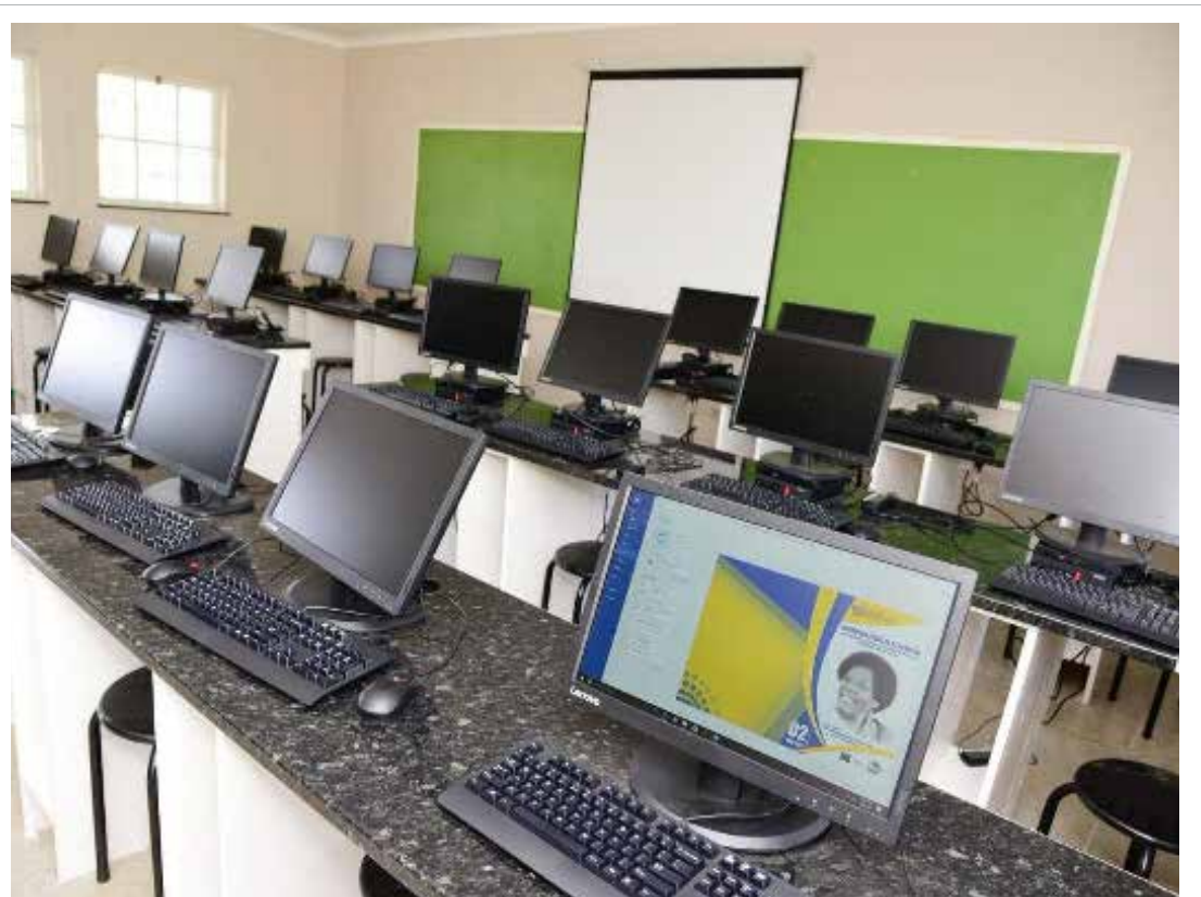
Computers donated by the Eastern Cape Department of Education and the Industrial Development Corporation to the Albertina Sisulu Primary School in Tsomo in the Eastern Cape.