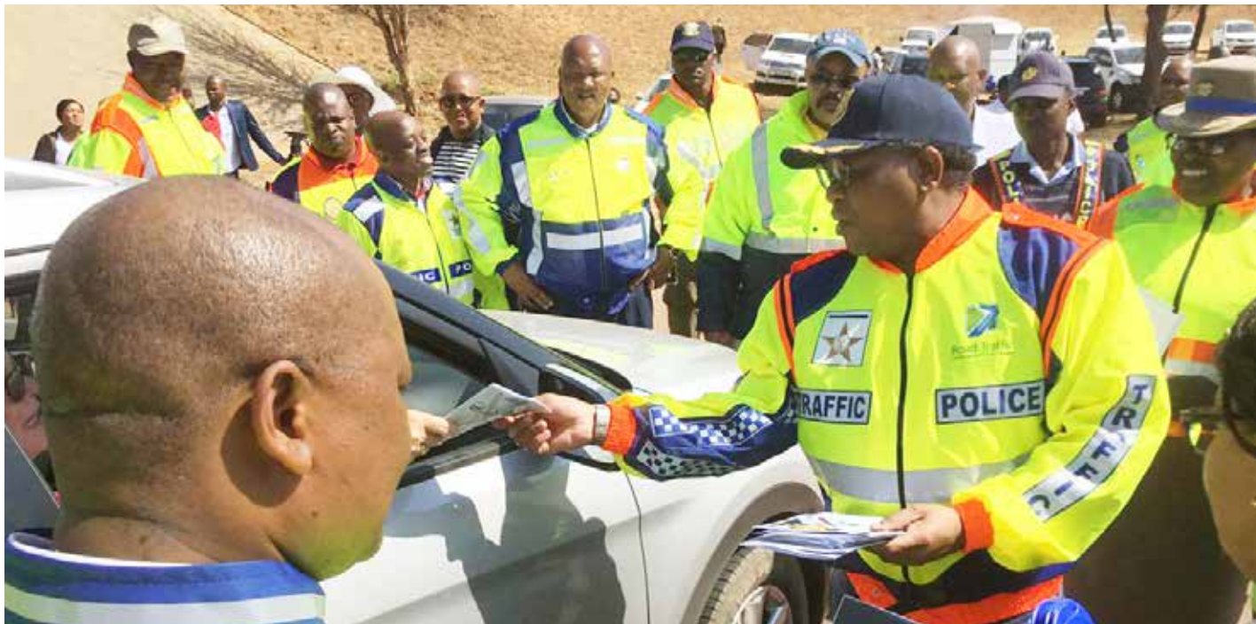
■ Minister of Transport Fikile Mbalula informing the public about AARTO.