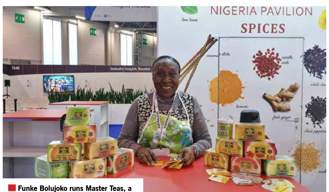
business that sells herbal teas.