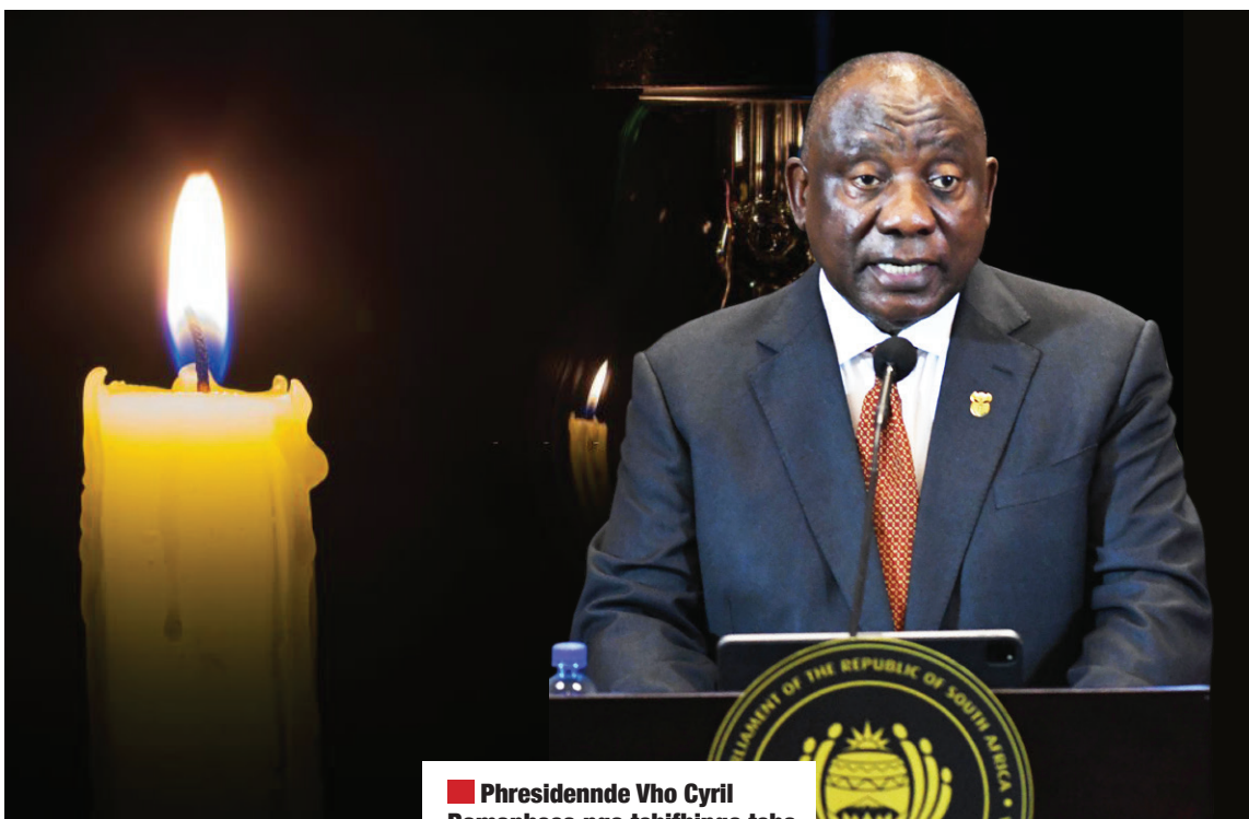
Phresidennde Vho Cyril Ramaphosa nga tshifhinga tsha u netshedza Mulaedza wa nga ha Tshiimo tsha Lushaka.

P hresidennde Vho Cyril Ramaphosa vho divhadza Tshiimo tsha Tshiwo tsha Lushaka tshine tsha do thoma u shuma na zwenezwo sa maga a u lingedza u tandulula thaidzo ya zwa fulufulu ine shango la Afrika Tshipembe la khou tangana nayo zwazwino. Lwa tshifhinga tsha minwedzi i si gathi tshimiswa tsha Eskom