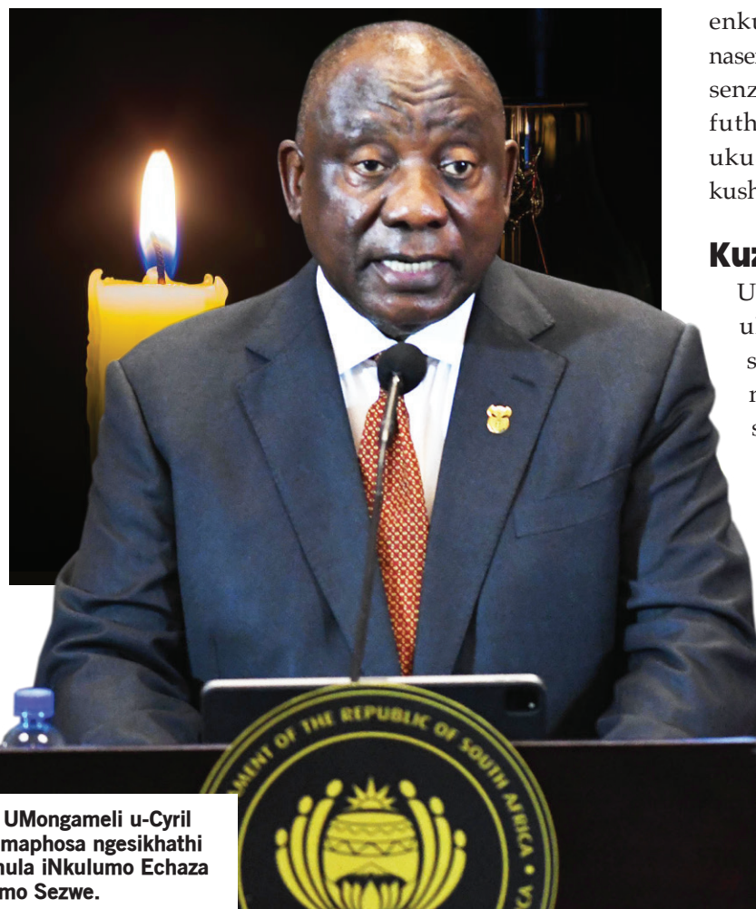
UMongameli u-Cyril Ramaphosa ngesikhathi ethula iNkulumbo Echaza Isimo Sezwe.

Ugcizelele ukuthi ukushoda kukagesi isimo esingasihle neze