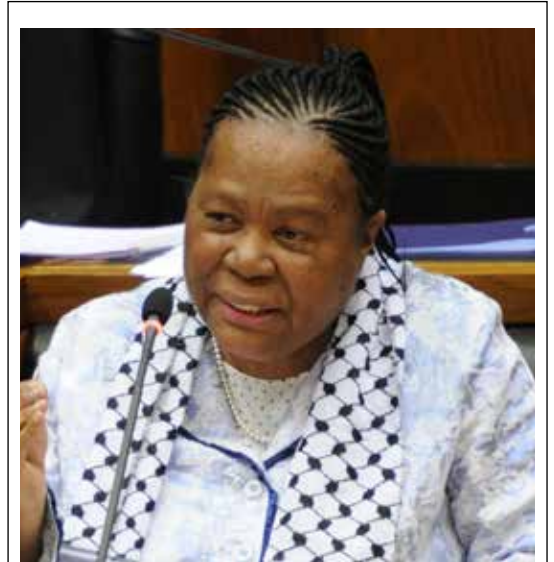
Science and Technology Minister Naledi Pandor says her department plans to increase the number of science graduates in the country.

Females make up 36 per cent of the country's researchers, a figure the Minister hopes will increase to 50 per cent by 2017.