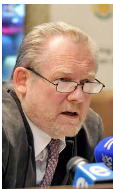
South Africa's clothing and automotive sectors can expect more backing from the Department of Trade and Industry, says Minister Rob Davies.