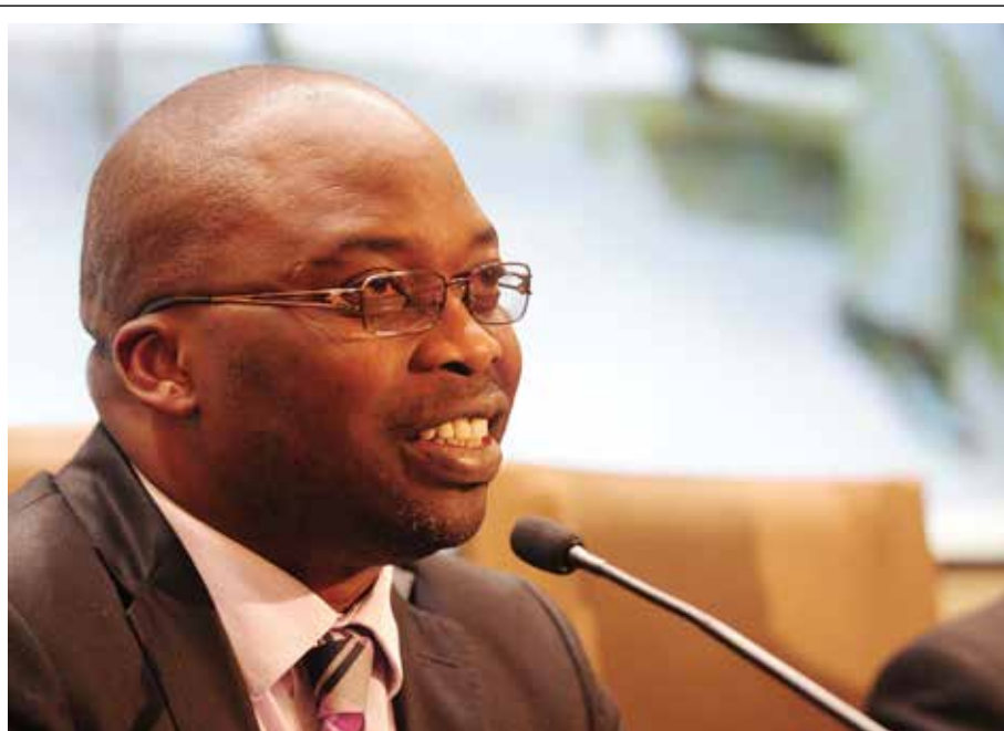
Justice and Correctional Services Minister Michael Masutha says developing and improving courts is one of the priorities of his department.

"We have a total budget of R 67.8 million to rehabilitate 30 000 hectares and create 9 000 jobs for the current financial year," he said.