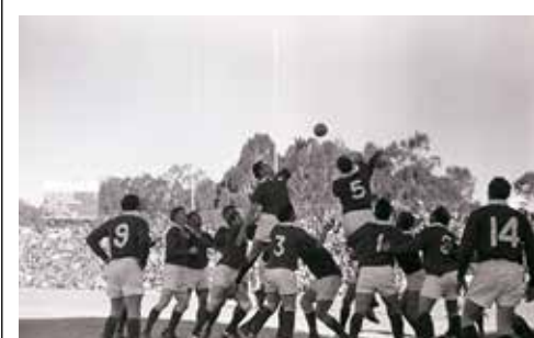
Sport and Recreation Minister Fikile Mbalula says his department will take action against sports bodies that are lagging behind in transformation efforts.