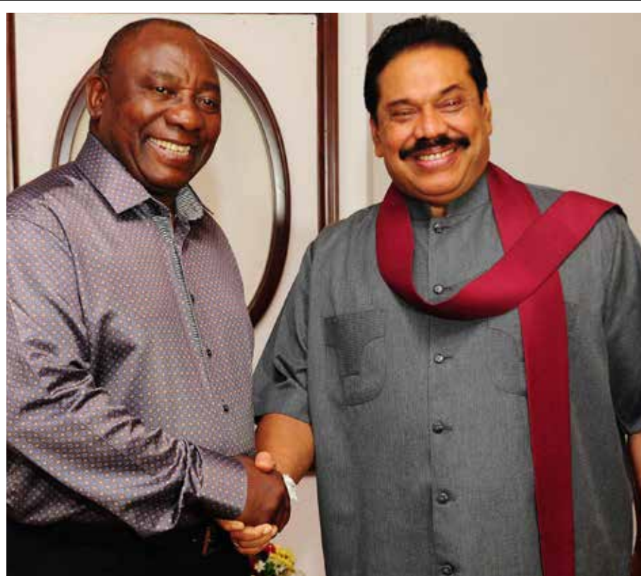
Deputy President Cyril Ramaphosa with Sri Lankan President Mahinda Rajapaksa during a recent visit to Sri Lanka.

that Deputy President Ramaphosa had been appointed as South Africa's Special Envoy to Sri Lanka and South Sudan. His appointment came at the request of Sri Lanka and South Sudan for assistance in bringing about peace and reconciliation.