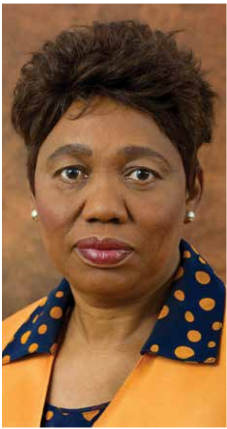
Basic Education Minister Angie Motshekga says government is committed to extending the reach of country's education system.