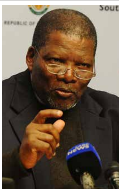
Rural Development and Land Reform Minister Gugile Nkwinti says youth and women empowerment will feature high on his department's agenda in the coming years.