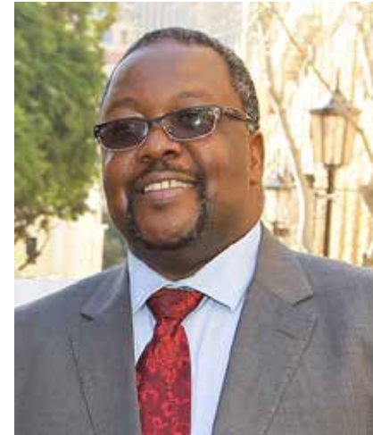
Police Minister Nkosinathi Nhleko says police will not only fight crime but also work hard to restore South Africans' faith in the criminal justice system.

Minister Nhleko said the country faced many challenges and called on various sectors to be part of the fight against crime and corruption.