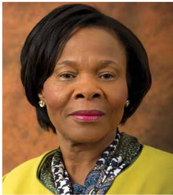
Minister of Women in The Presidency Susan Shabangu has urged all South Africans to work with government to address the challenges facing women.

The theme for Women's Month is "Celebrating 60 th Anniversary of Women's Charter and 20 Years of Freedom: Moving Women's Agenda Forward!" The Women's Charter outlined the aspirations of women for national liberation, emancipation – including political