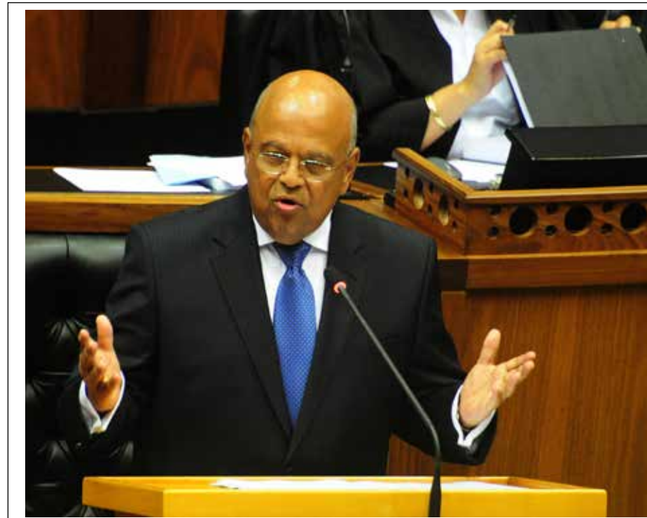
Cooperative Governance and Traditional Affairs Minister Pravin Gordhan says municipalities must deliver services to citizens without compromise.

"As we celebrate 20 Years of Freedom, we must recognise the tremendous strides we