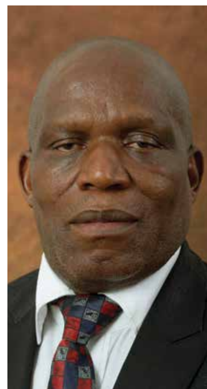
Agriculture, Forestry and Fisheries Minister Senzeni Zokwana says his department will focus on planting and harvesting land in rural areas.

Minister Zokwana said the livestock sector