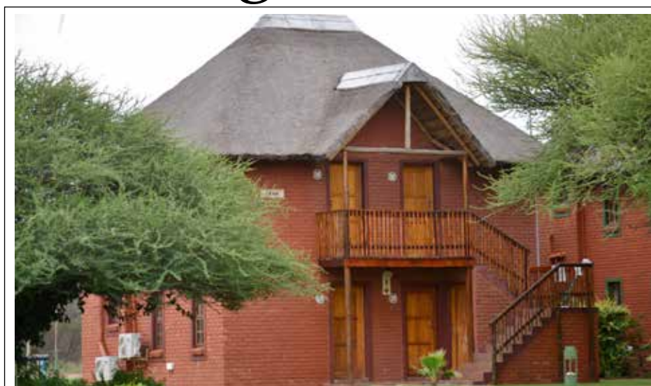
The Dikgatlong Lodge, in the North West, is benefiting the local community after the land it is situated on was handed back to the people it was taken away from in the 1960s.