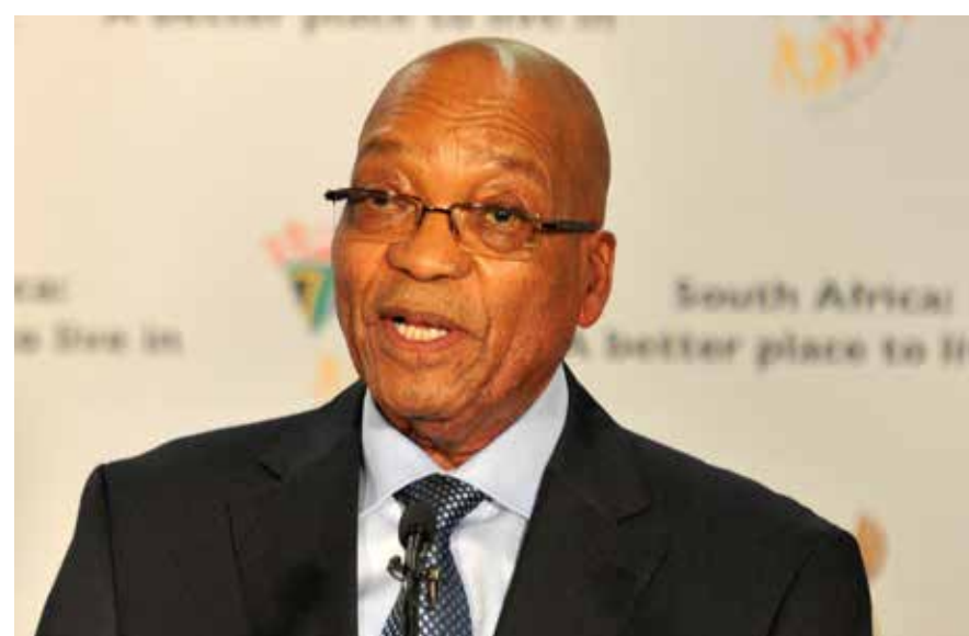
President Jacob Zuma says government is working hard to ensure that departments become more professional, people-centred and effective.

He added that the new Working Group on Disability would enable The Presidency to