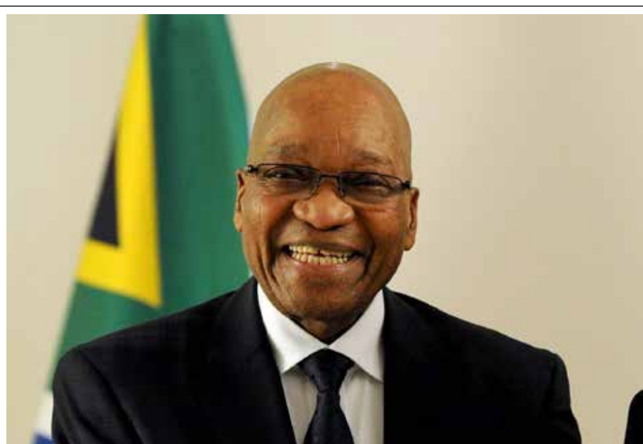
President Jacob Zuma says Africa's youth need to realise the significant role agriculture can play in the economy.

"In order to respond to crises on the continent, the AU Summit took a decision last year to operationalise the African Capacity for Immediate Response to Crises as an interim mechanism, until the African Standby Force is established."