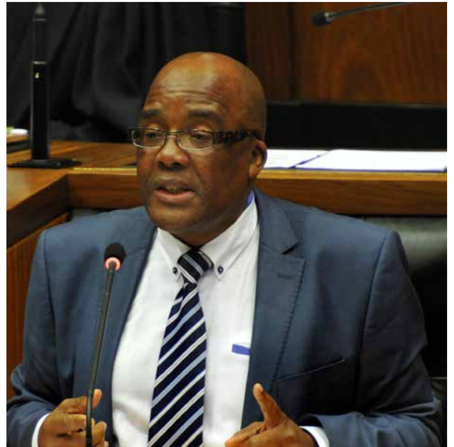
Health Minister Aaron Motsoaledi has announced that from next year government will make anti-retroviral treatment available to HIV positive patients with a CD4 count of less than 500.

Minister Motsoaledi added that of the 52 million people in South Africa, 35 million were between the ages of 16 and 64 (those considered sexually active). This group need to be prioritised for HCT.