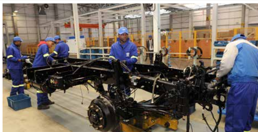
The newly opened First Automobile Works (FAW) plant in Port Elizabeth is expected to create a thousand jobs.

production and broadening and deepening of component manufacture by the year 2020.