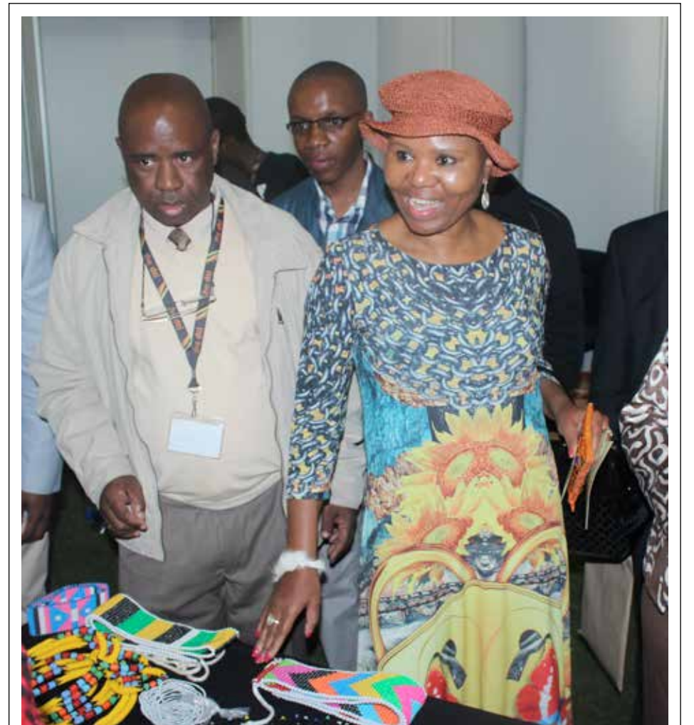
Minister of Small Business Development Lindiwe Zulu interacts with cooperatives at an exhibition held during International Cooperative Day.

amples of South Africans making things happen for themselves.