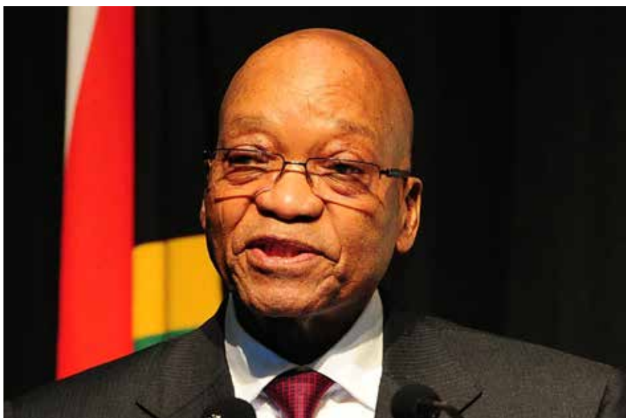
President Jacob Zuma says it is through initiatives such as Operation Phakisa that government is building a better life for all South Africans.