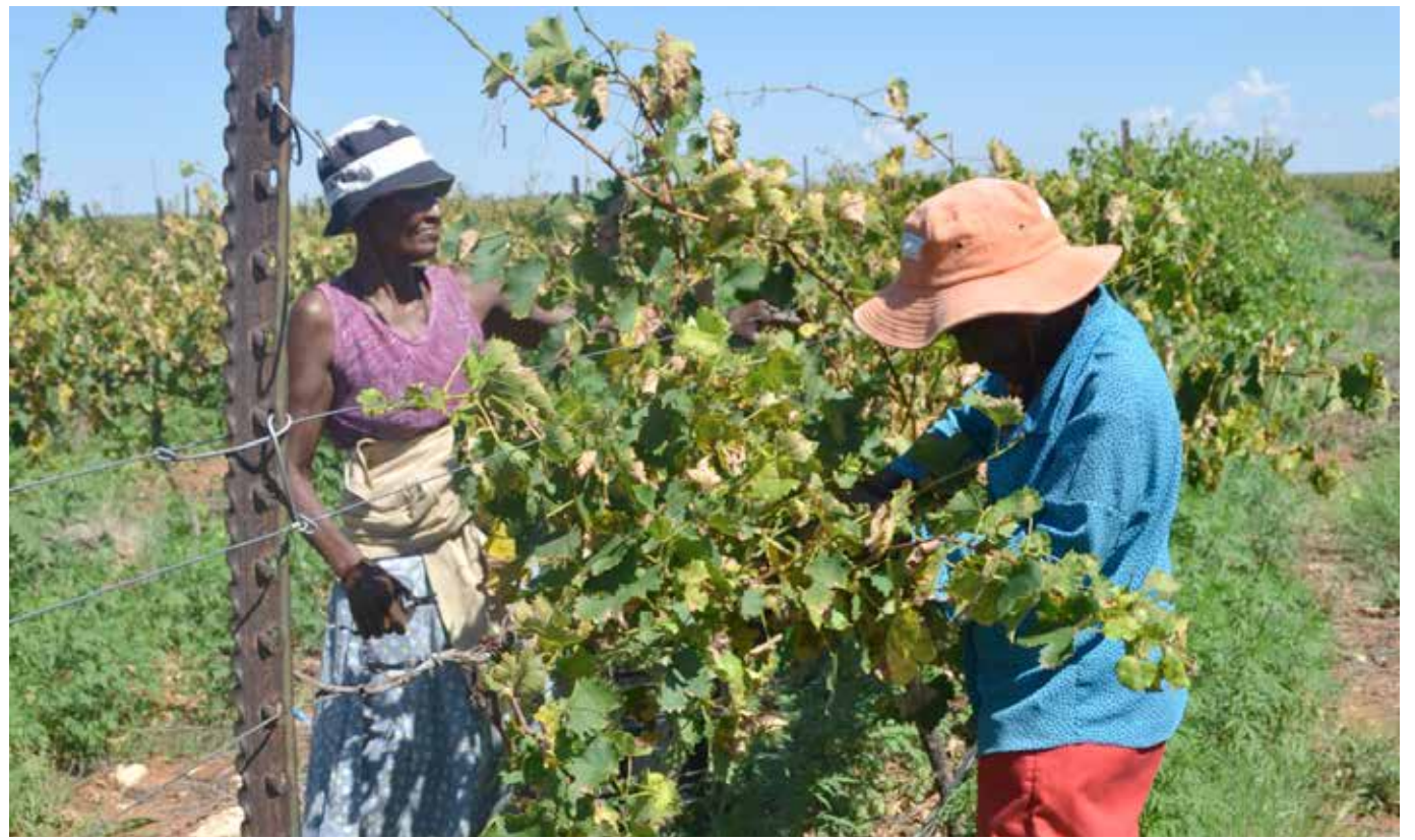
Black farmers will benefit from training that will be offered at a multi-purpose training and development centre currently being built in Pretoria.

"We are creating a class of black people who are going to run the country's economy over the next decade. It will actually anchor them because scientific training will be done here.