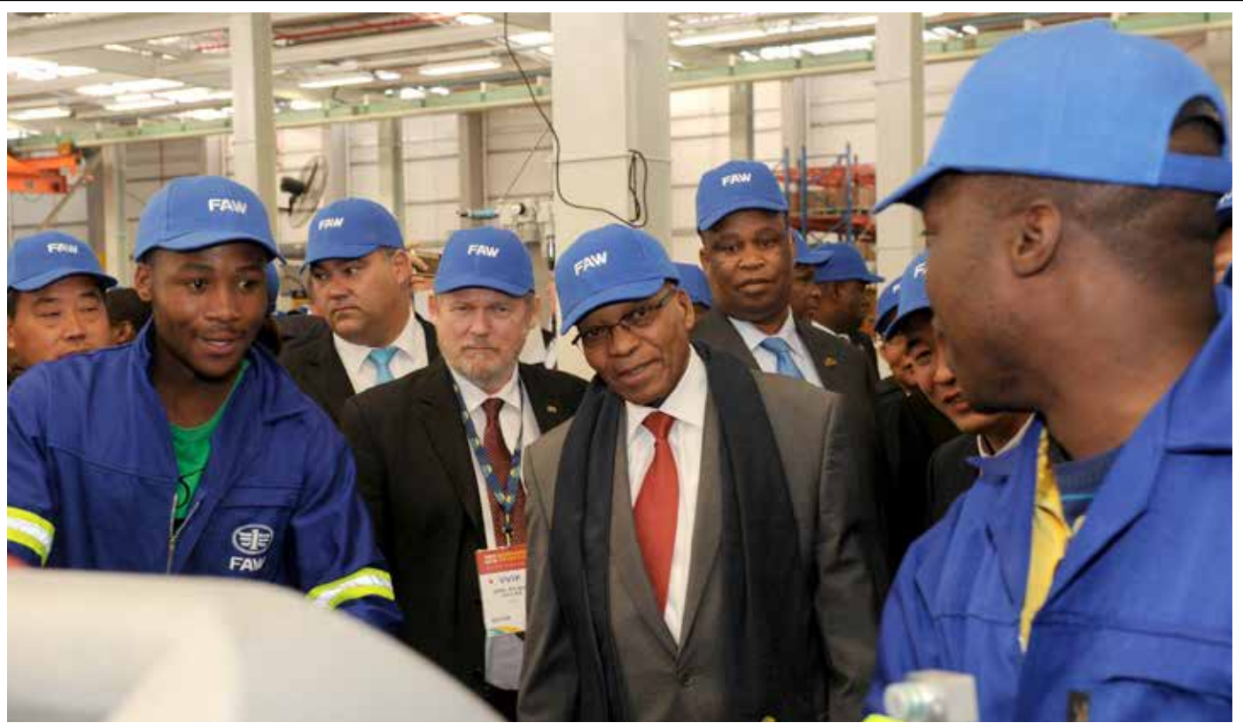
President Jacob Zuma and Trade and Industry Minister Rob Davies interact with workers during the official launch of the First Automotive Works (FAW) assembly plant in the Eastern Cape.

The country's Vision 2020 strategy for the industry refers to the doubling of local vehicle