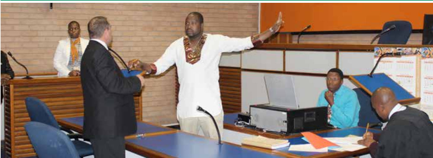
The new Sexual Offences Court in Bethlehem will provide the necessary treatment for victims of sexual abuse.