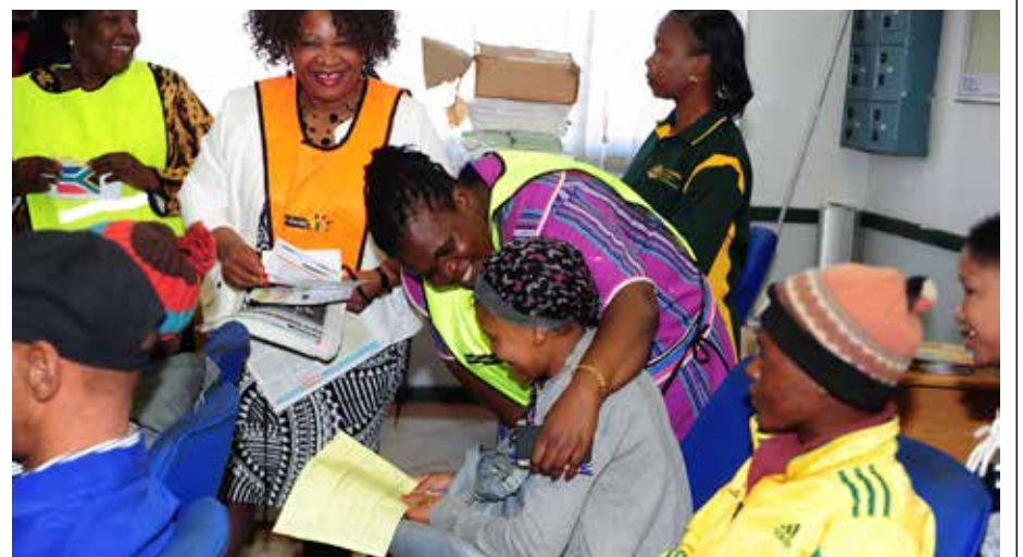
Minister of Communications Faith Muthambi at the launch of Mamelodi Thusong Service Centre. The Minister tested the new infrastructure and interacted (below) with community members at the centre.

is one of the first unique initiatives introduced by the democratic government, and integrates services across the three spheres of government.