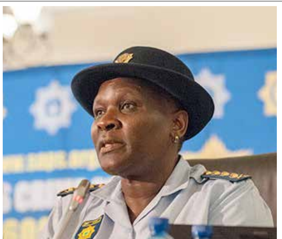
National Police Commissioner Riah Phiyega says the South African Police Service is in the business of arresting criminals.

He said in line with the National Development Plan, the focus would be on strengthening the criminal justice system, professionalising the police as well as building safety.