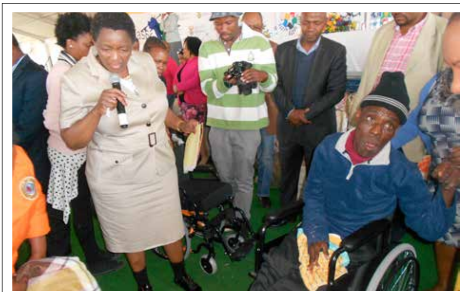
Minister Bathabile Dlamini is working hard to protect the rights of people with disabilities.

Vuk'uzenzele looks at some of the department's highlights and programmes.