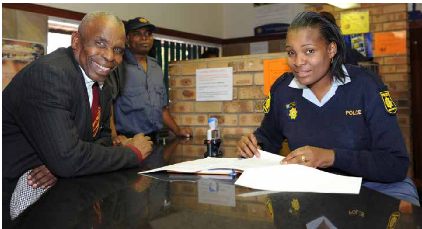
Minister of Police Nkosinathi Nhleko wants to improve the image of the South African Police Service in communities.