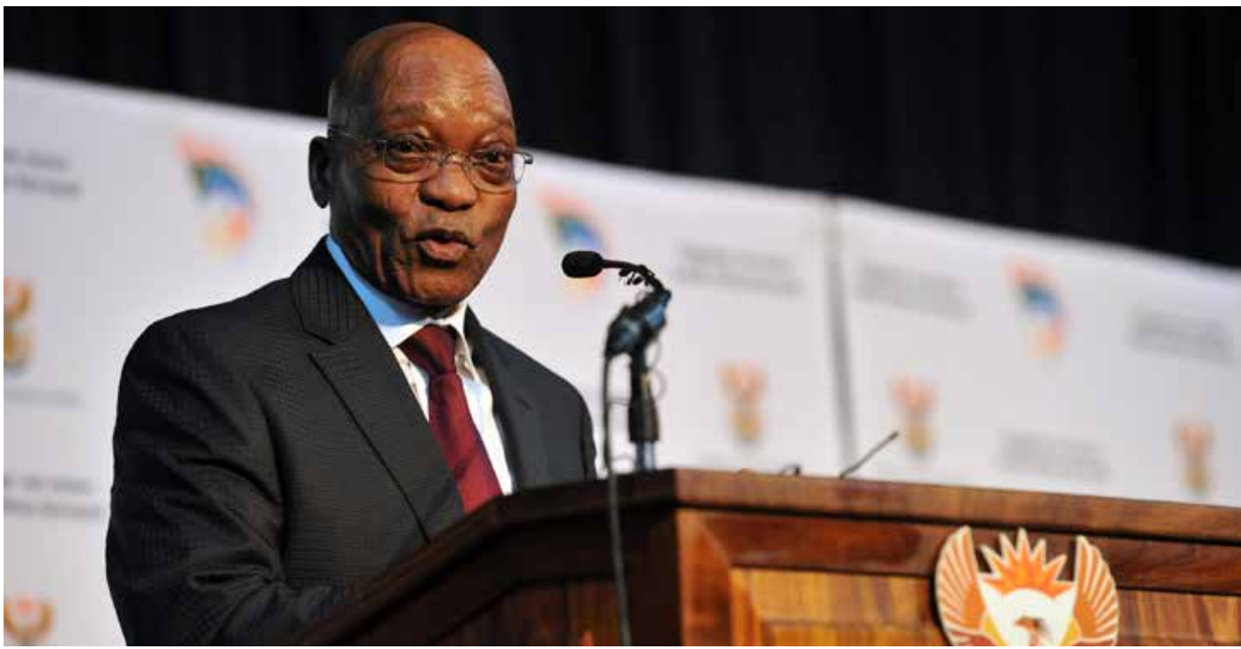
President Jacob Zuma addresses the President Local Government Summit in Gauteng.