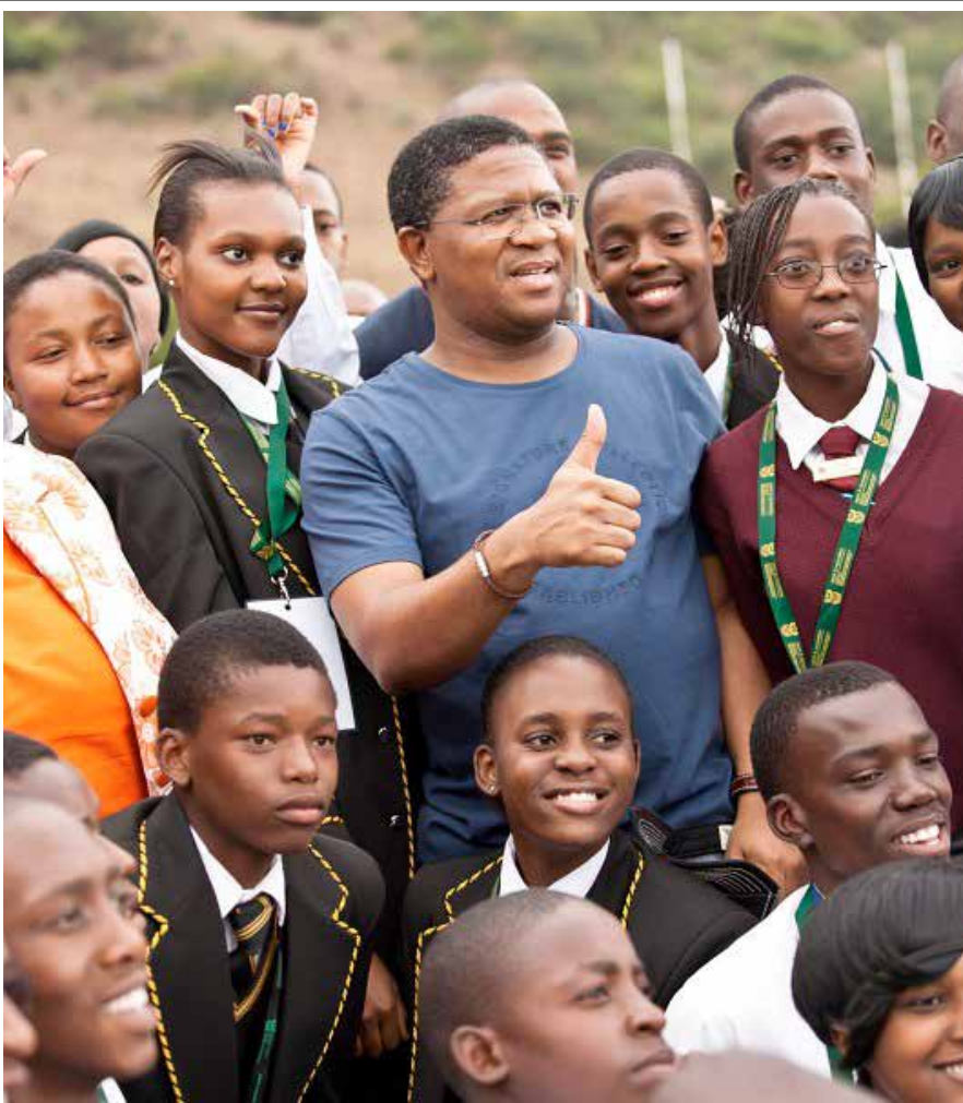
Minister Fikile Mbalula interacts with a group of learners during a school sports event.