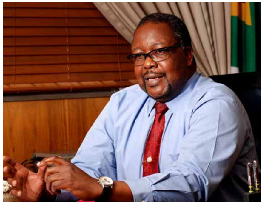
Police are working hard to keep South Africans safe. Minister Nkosinathi Nhleko (right) says more needs to be done to improve safety in the country.