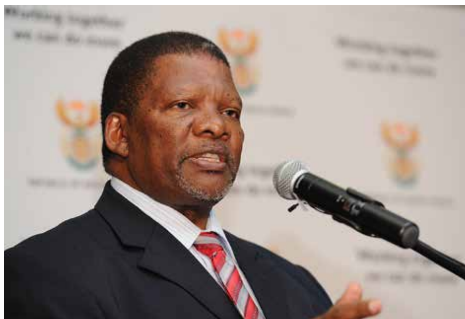
Minister of Rural Development and Land Reform Gugile Nkwinti.

The first period for lodgement was opened from 1994 to 1998.