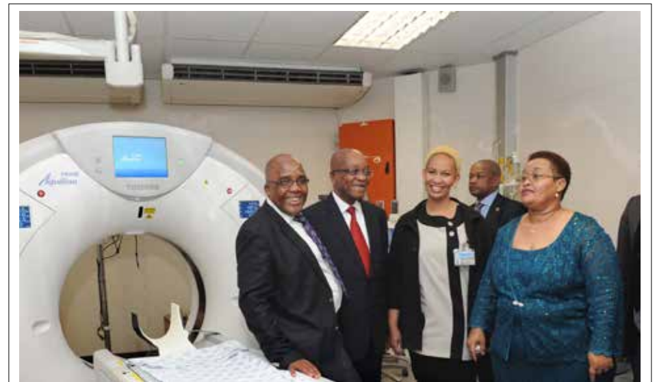
President Jacob Zuma, accompanied by the Minister of Health Dr Aaron Motsoaledi, and Northern Cape Premier Sylvia Lucas, examine the world-class equipment at Dr Harry Surtie Hospital.

President Zuma said the transfer of hospital services from the old Gordonia Hospital to