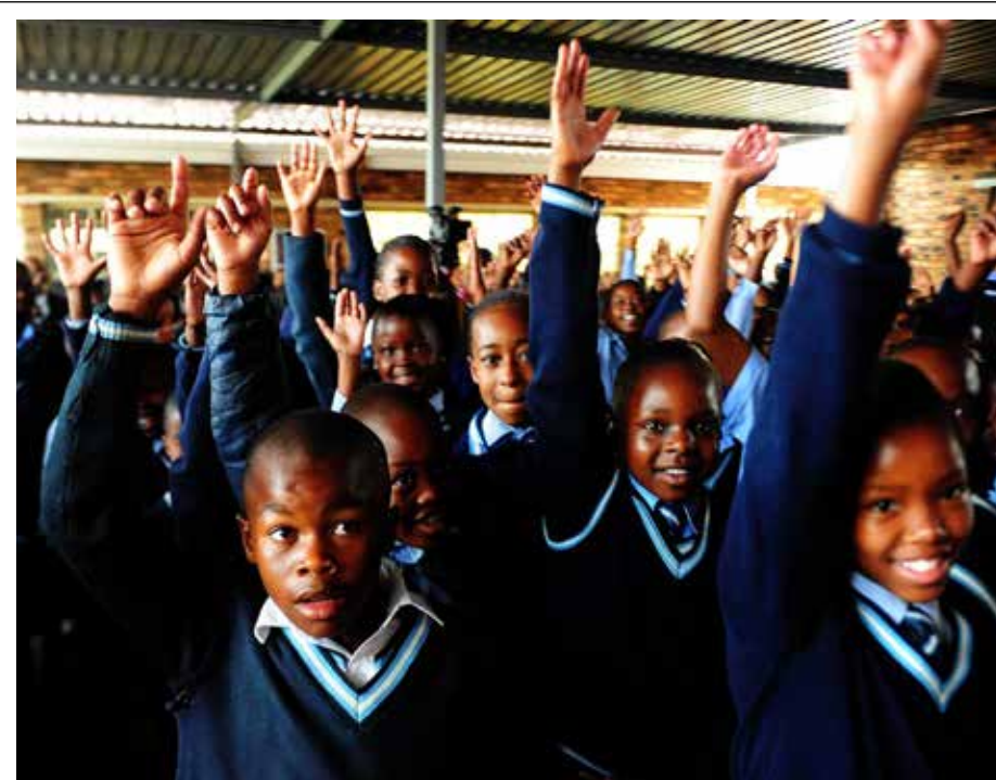
The Learn English Audio Project will help learners to improve on their literacy, listening and speaking skills.

of many first year students at universities," she explained.