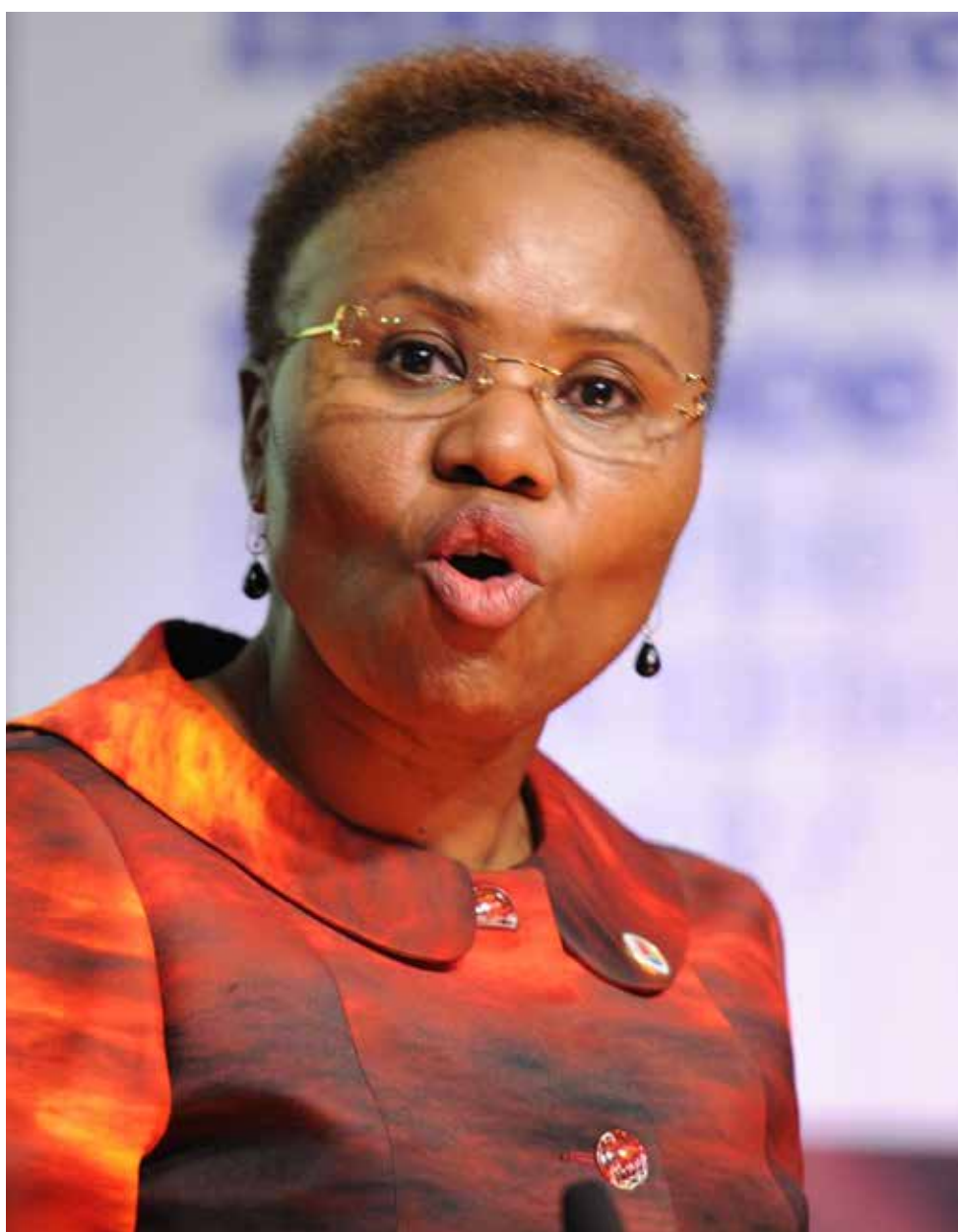
Minister of Small Business Development Lindiwe Zulu believes in creating a nation of entrepreneurs, not job seekers.