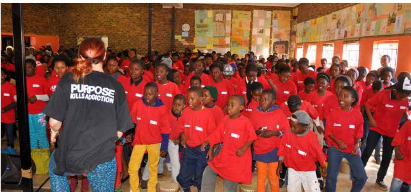
Learners participating in the launch of the Jonathan Butler Holiday Programme, which is aimed at keeping children off the streets and helping them to focus on a healthy and positive future.