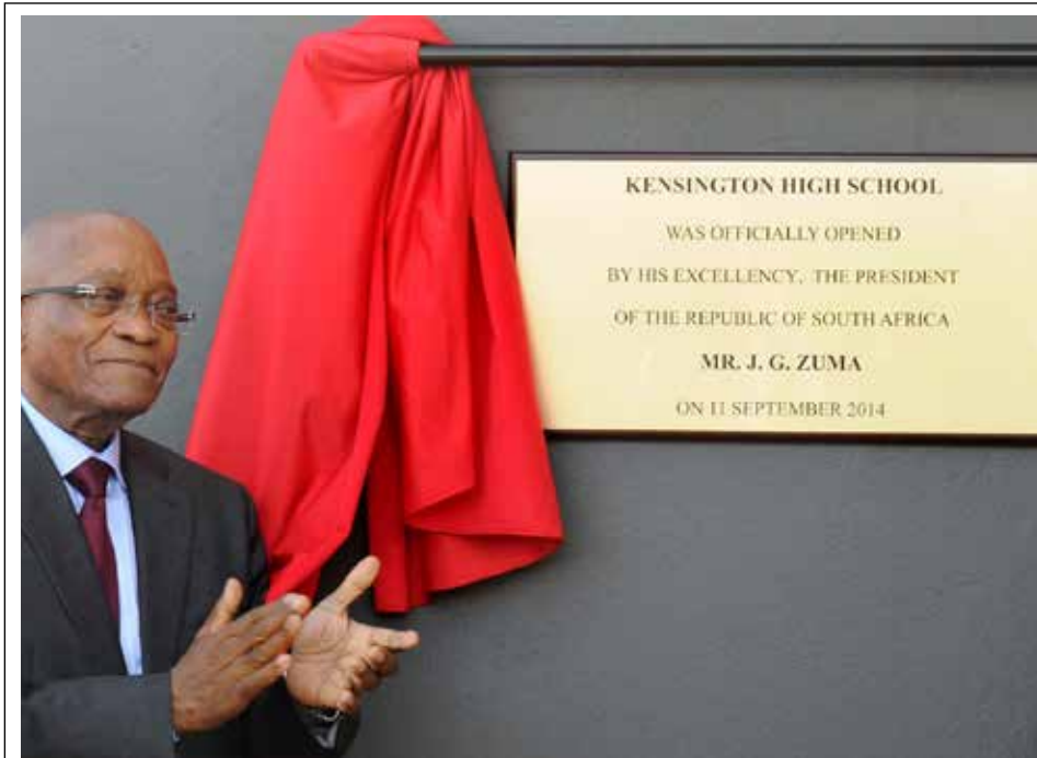
President Jacob Zuma opened the newly refurbished Kensington High School in Cape Town. The school forms part of the Accelerated Schools Infrastructure Delivery Initiative.