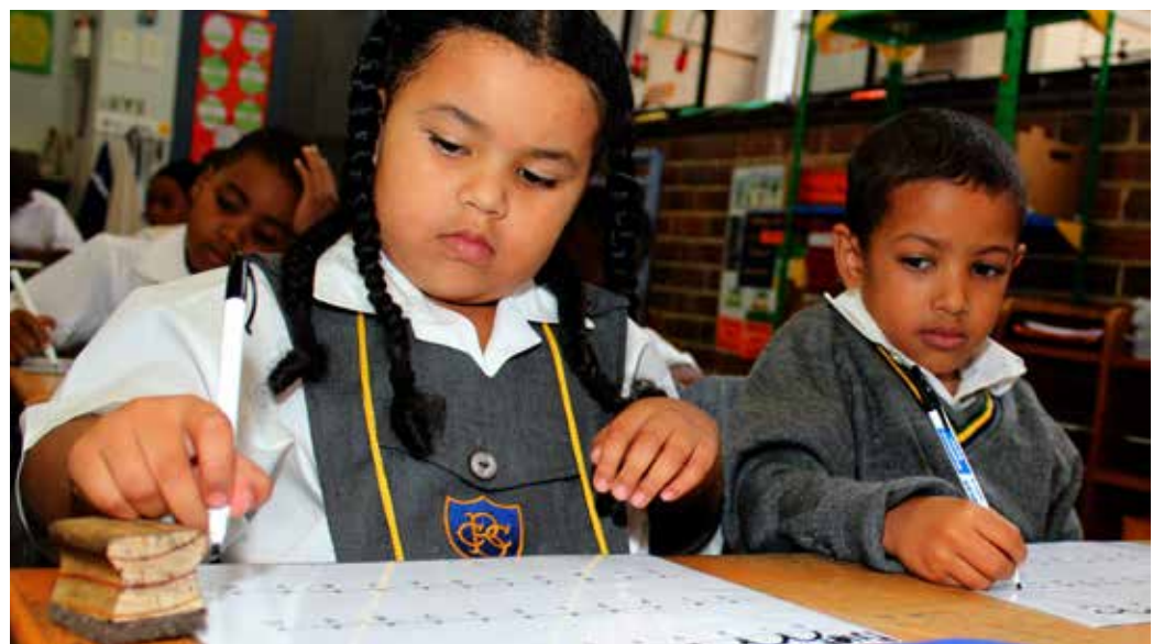
The Department of Basic Education wants to improve the standard of education in South Africa.