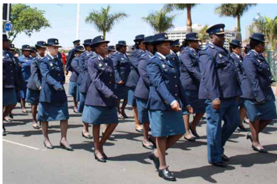
Currently, South Africa has one police officer for every 346 South Africans.

In addition, home robbery was up 7,4 per cent, with 1 334 more cases than the previous year.