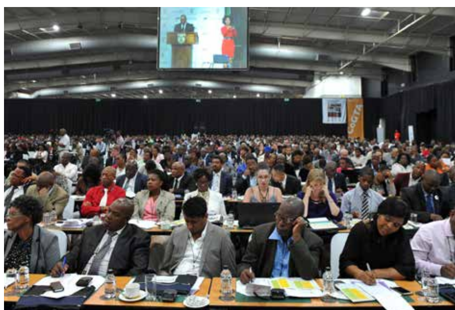
Delegates at the President Local Government Summit were told that local government has made progress in delivering basic services to communities.

The municipality also convenes mayoral outreach meetings to hear the concerns of residents, and attempted to address them in a week, where possible.