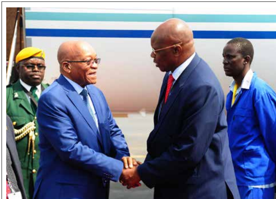
Zimbabwean Finance Minister Patrick Chinamasa welcomes President Jacob Zuma on arrival at the Victoria Falls International Airport.

Member states were urged to continue putting in place measures to prevent its spread and