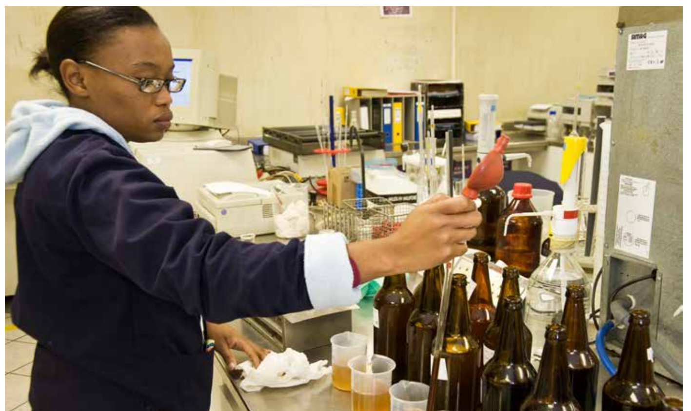
The new chair in science, mathematics and technology is set to improve the quality of teaching in these subjects at township and rural schools.

He said the success of government's National Infrastructure Plan, which promises to create